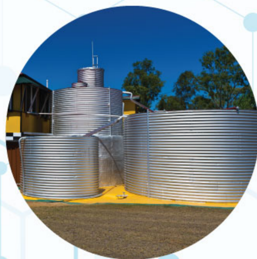
RESERVOIR WATER TANK