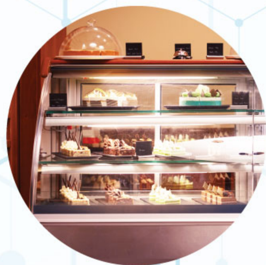
REFRIGERATED BAKERY DISPLAY