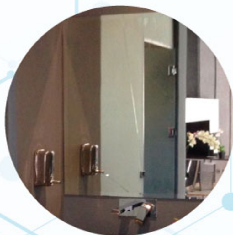
BONDING MIRROR ONTO WALL