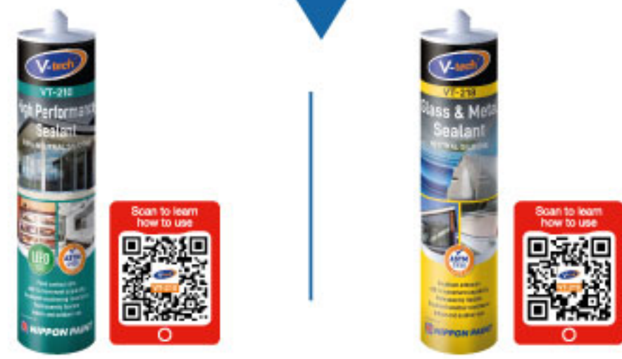
VT-210 / VT-210S High Performance Sealant VT-218 / 218C Glass & Metal Sealant