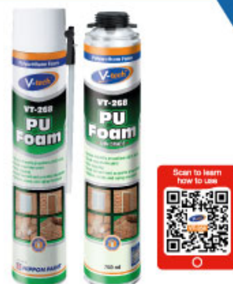
VT-268 / VT-268GG PU Foam