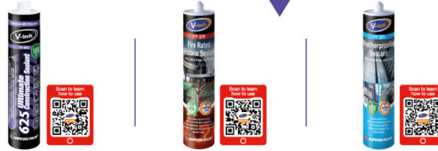
VT-625 / VT-625S Ultimate Construction Sealant VT-219 Fire Rated Silicone Sealant VT-211 / VT-211S Weatherproofing Sealant