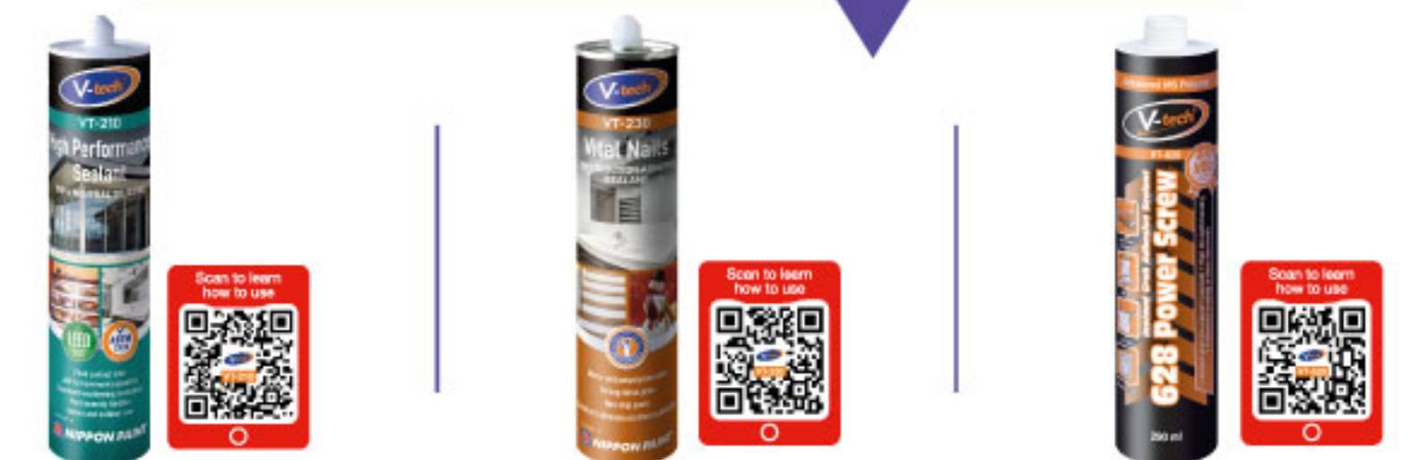
VT-210 / VT-210S High Performance Sealant