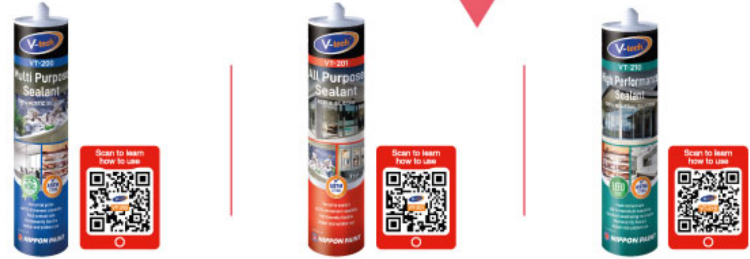
VT-200 Multi Purpose Sealant VT-201 All Purpose Sealant VT-210 / VT-210S High Performance Sealant