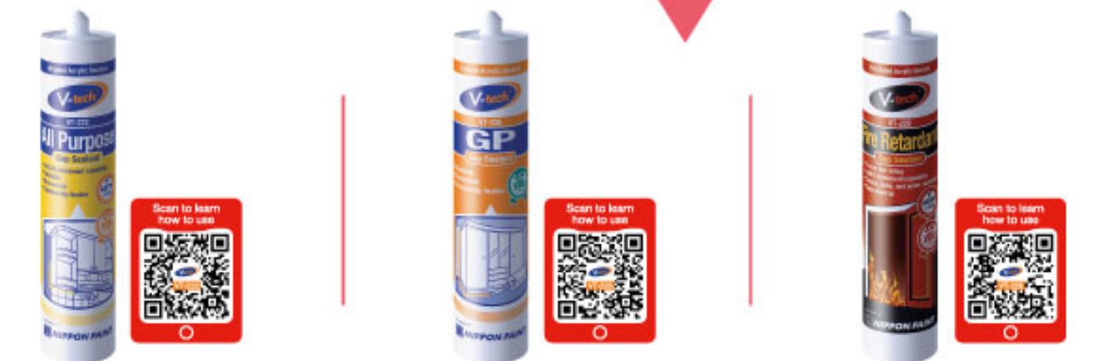
VT-222 All Purpose Gap Sealant