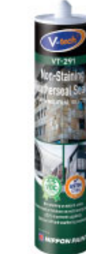
VT-291 Non-Staining Weatherseal Sealant