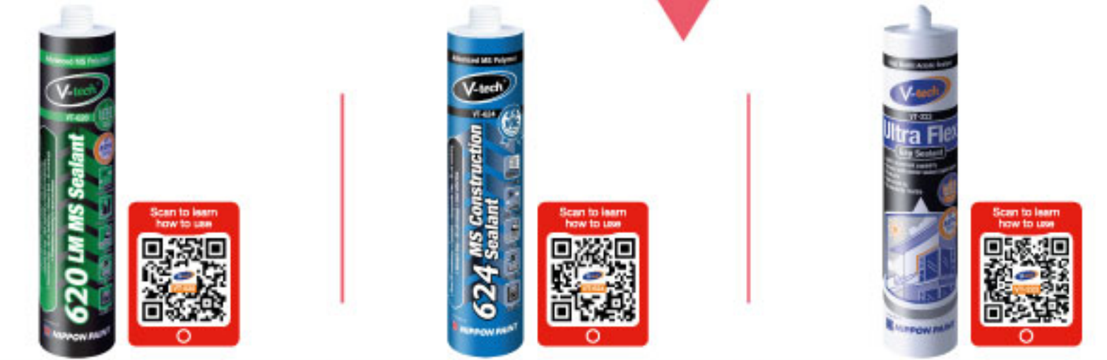
VT-620 / VT-620S LM MS Sealant