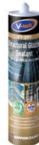
VT-299 Structural Glazing Sealant