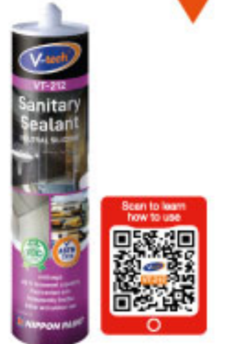
VT-212 Sanitary Sealant